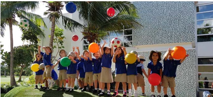
Cayman International School

With its headquarters in Princeton, NJ, USA and locations in China and the Middle East, ISS currently owns or operates about two dozen international schools around the world and promotes innovation and best practices for global education through its core services. Today, ISS is at the forefront of innovation by creating personalized, world-class schools that embrace local culture while showcasing the very best practices in modern education.